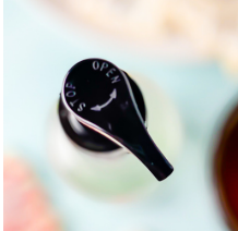
mono material pumps