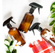
mono material sprayers