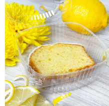
PET clamshell containers