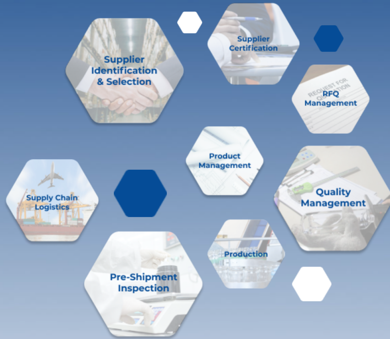
2021: Above is a screenshot taken from HB International's home page of their new website. The image includes all of the Global Solutions that HBI provides their customers. Access to the website: www.hbint.biz

HB International is a manufacturing sourcing firm specializing in custom tailored "Concept to Completion" solutions.